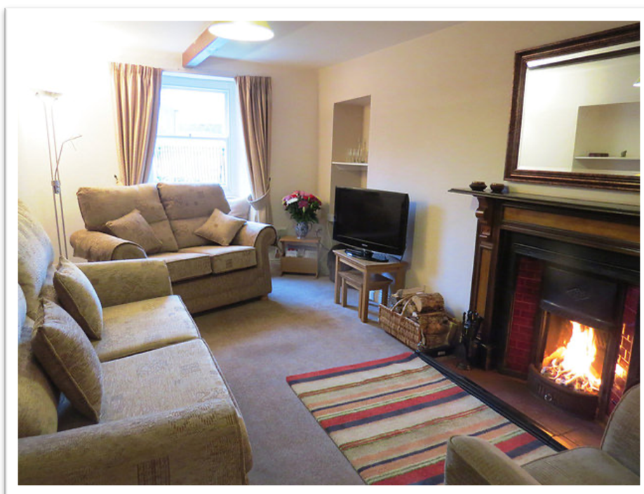
Figure 6: Keld Manse offers excellent accommodation for ministers in residence and is available as a holiday let at other times.