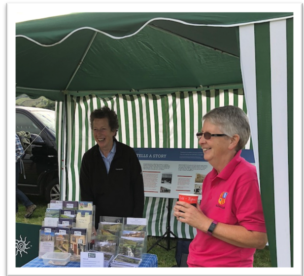
Figure 1: Volunteers at Muker Show 2019. The show was cancelled in 2020 due to COVID-19 but we hope to be back in 2021.