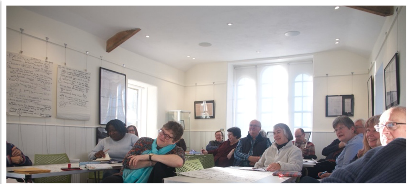
Figure 3: The upper room in the Literary Institute provides excellent facilities. We have excellent broadband but are still waiting for 1G let alone 5G mobile.