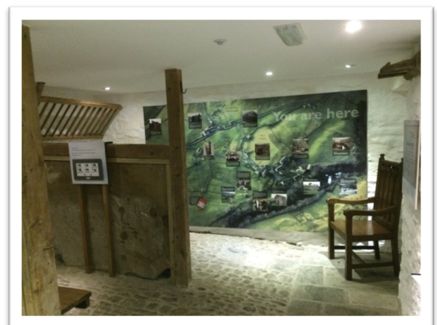
Figure 2: The Visitor Centre is a huge success. We now plan to extend this offer including interpretation on the role of the churches in Swaledale in a new discovery room.