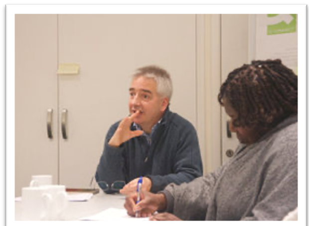
Figure 4: Keld Resource Centre is an ideal location for small group work such as awaydays and training